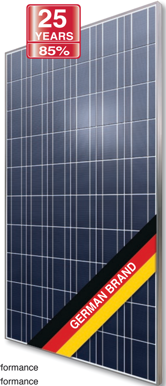
Fig. similar 60P156EN150505A

Exclusive linear AXITEC high performance guarantee!